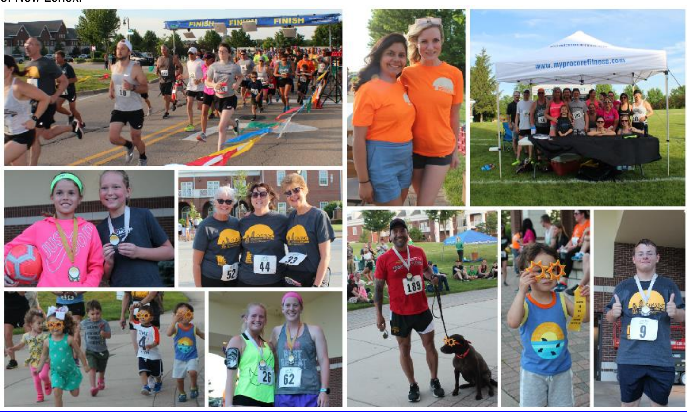
To see all the photos from the event, check out the race Facebook page!

Honor Roll Sponsors: Advanced Eye Care, S.C., ChiroOne Wellness, Fabians Flooring, Inc., JointPro Physical Therapy, Kurtz Memorial Chapel, Langlois Insurance Agency, Rt. 6 Food N Fuel LLC, Old Plank Trail Community Bank, Paramont EO, Inc. / Crest Lighting, Phillips Chevrolet, ProCoreFitness, R&R Orthodontics, ReClaim Fitness, & the Village of New Lenox.